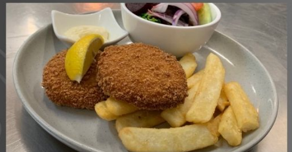
Senior's Lunch Everday Senior's Lunchtime Special Menu $18