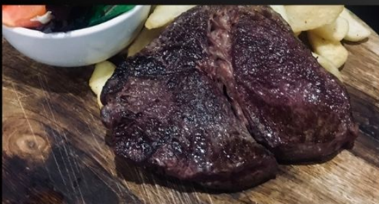
Saturday Special Steak of the Day From $19