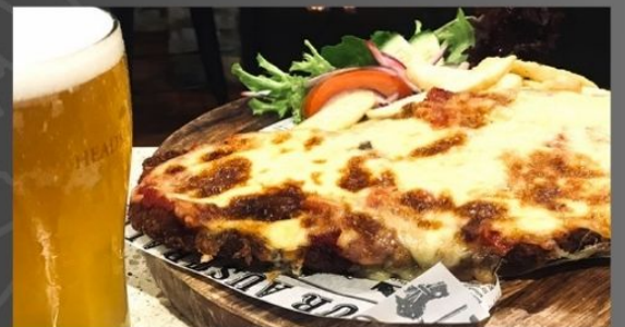
Everday Pint & Parm Pint of Cooper's Tap Beer & 300gm Beef or Chicken Schnitzel Parmigiana $24

The Nor East 583 North East Road, Gilles Plains, S.A 5085 ph. 8261 7711 noreast@adam.com.au