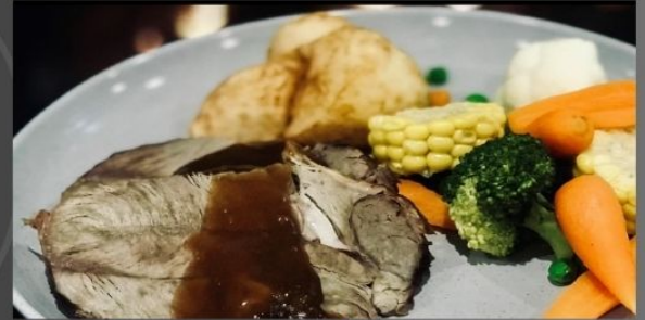
Sunday Special Roast of The Day $19