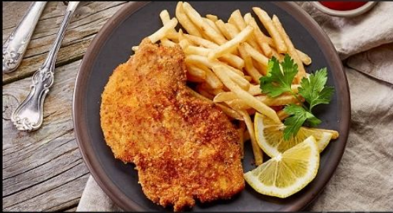
Thursday Special Schnitzel 300gm Beef or Chicken $19