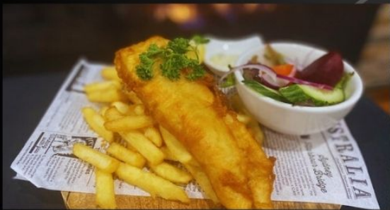
Friday Special Fish & Chips $18